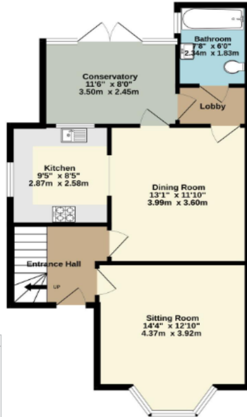
Ground Floor 622 sq.ft. (57.8 sq.m.) approx.